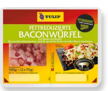
Fat-reduced Diced Bacon